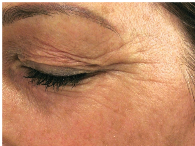
32 DAYS AFTER A SINGLE TREATMENT

Having a tan complexion has often been associated with a healthy appearance. Today we know that excessive exposure to ultraviolet light can have detrimental effects on our skin. Sun exposure over a period of time can cause accelerated damage, leading to areas of increased pigmentation, fine lines or wrinkling.